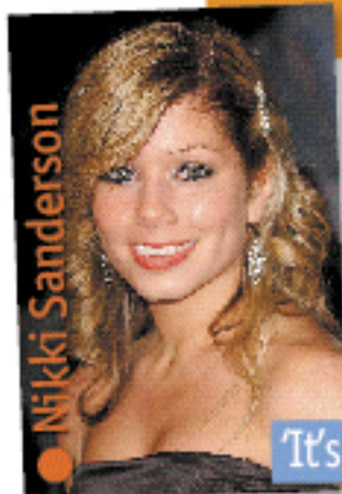
● Nikki Sanderson